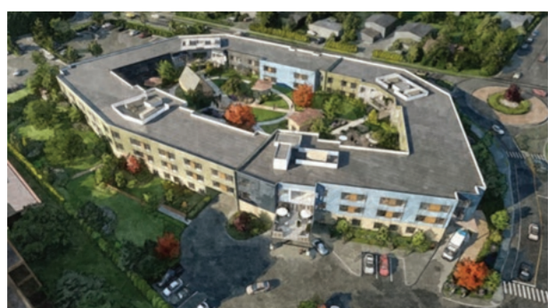
Providence Living at the Views Artist's rendition

Vice-President of Education and the inaugural Director of the Centre for Education and Knowledge Exchange in Aging at Baycrest, Toronto. He is the founding Co-Chair of the Canadian Coalition for Seniors' Mental Health and Chair of the Coalition's National Guidelines Project.