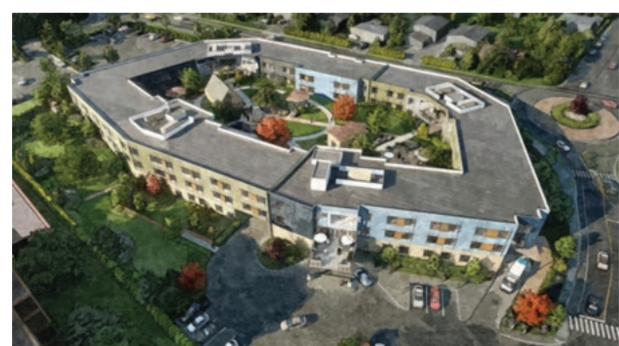
Providence Living at the Views Artist's rendition

Vice-President of Education and the inaugural Director of the Centre for Education and Knowledge Exchange in Aging at Baycrest, Toronto. He is the founding Co-Chair of the Canadian Coalition for Seniors' Mental Health and Chair of the Coalition's National Guidelines Project.